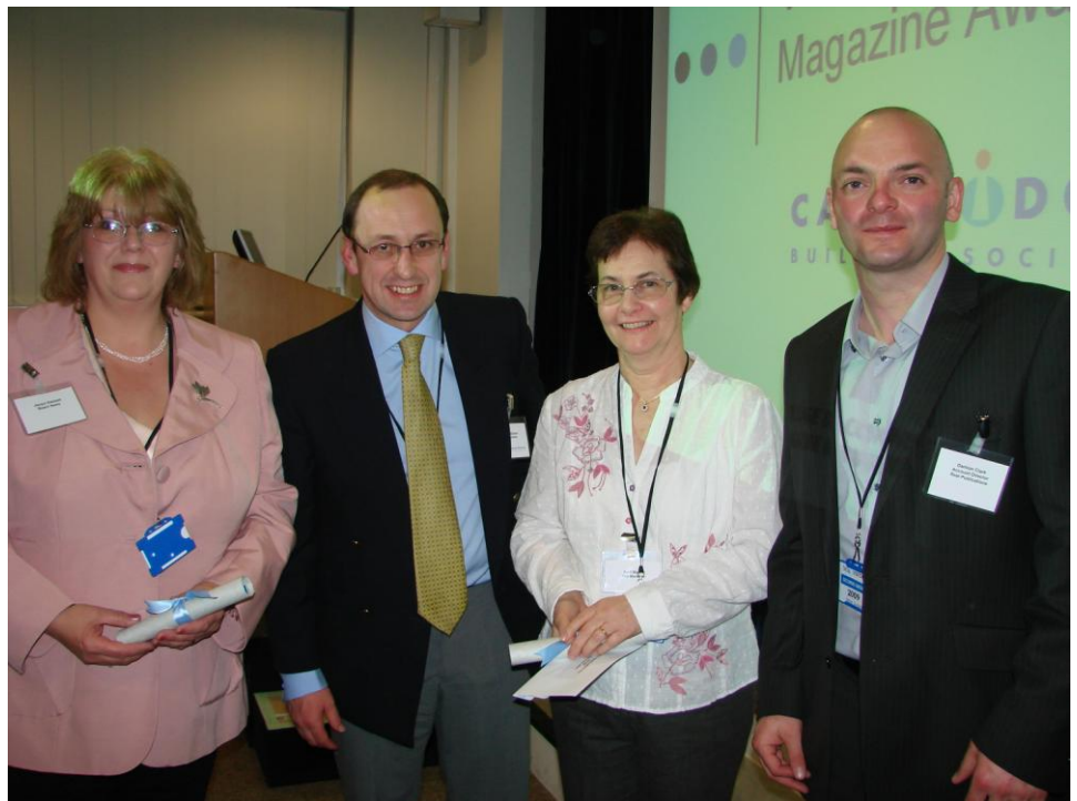
Presentation of certificate at the award ceremony

Earlier this year Beach News was entered into the Cambridge Building Society's Village & Community Magazine Awards. We were very pleased to be awarded runner up in the Judges' Special Award category (for use of images on the front cover, reflecting the community).